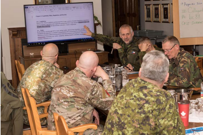
NCO Corps PD Reference Guidance Project Team Meeting, Saint-Jean-sur-Richelieu, Canada, May 2019

This document serves as a guide that complements the NCO Professional Military Education (PME) Reference Curriculum (RC). The NCO PME RC focuses exclusively on the structure and content of NCO courses. The NCO Corps Professional Development Reference Guidance is designed to help nations and Defence Education Enhancement Programme (DEEP) expert teams identify areas that are necessary to develop a professional NCO Corps but lie beyond the immediate scope of education. Building a solid foundation with critical milestones for personnel will lead to a professional, empowered, educated, and motivated NCO Corps. To that end, nations are encouraged to use this guide to identify necessary components to develop a professional NCO Corps and pinpoint challenges that cause stagnation in NCO educational development.