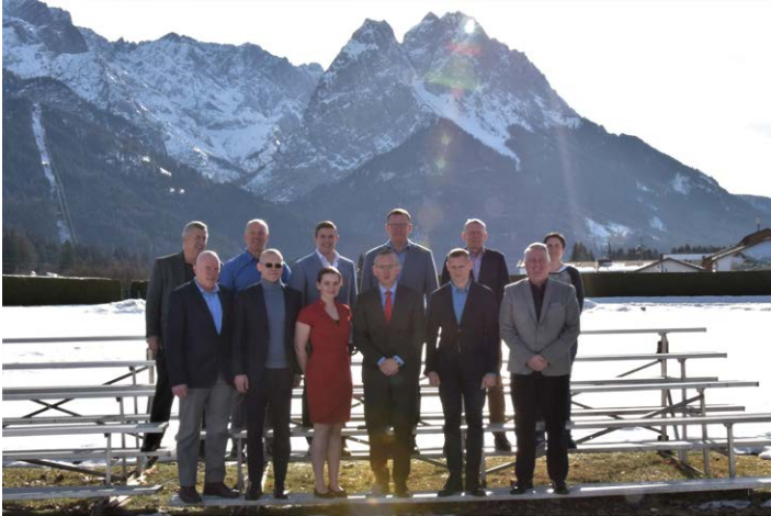
NCO Corps PD Reference Guidance Project Team Meeting, Garmisch-Partenkirchen, Germany, February 2019

about what programs to continue, alter, increase resources, cancel, etc. Internal evaluations and external validations are necessary to ensure learning objectives and outcomes are achieved based on curricula and operational requirements.