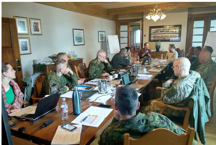
NCO Corps PD Reference Guidance Project Team Meeting, Saint-Jean-sur-Richelieu, Canada, May 2019