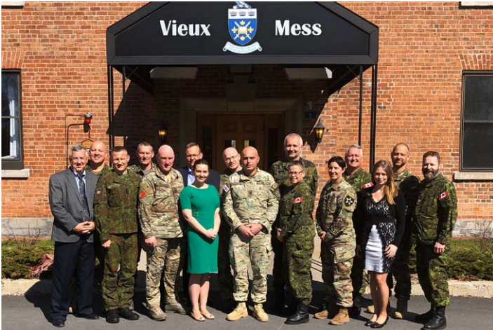
NCO Corps PD Reference Guidance Project Team Meeting, Saint-Jean-sur-Richelieu, Canada, May 2019