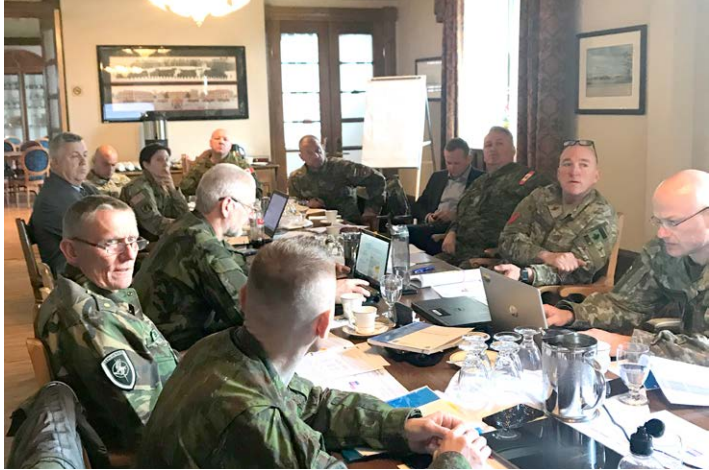
NCO Corps PD Reference Guidance Project Team Meeting, Saint-Jean-sur-Richelieu, Canada, May 2019

NCO Support Channels executes established policies, directives and orders, standardizes performance, executes and provides guidance on training and education ensures professional behavior and conduct of forces. The NCO Support Channel enforces established policies, executes directives and orders, enforces standards and performance, provides guidance on training and education, and promotes professional behavior and conduct. Additionally, NCO Support Channels must understand the Commander’s Intent in order to be able to issue effective implementing instructions throughout the forces.