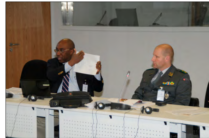
The Academic Lead (Canada) and the Project Manager (Switzerland) explaining their vision to the Team in Garmisch-Partenkirchen.