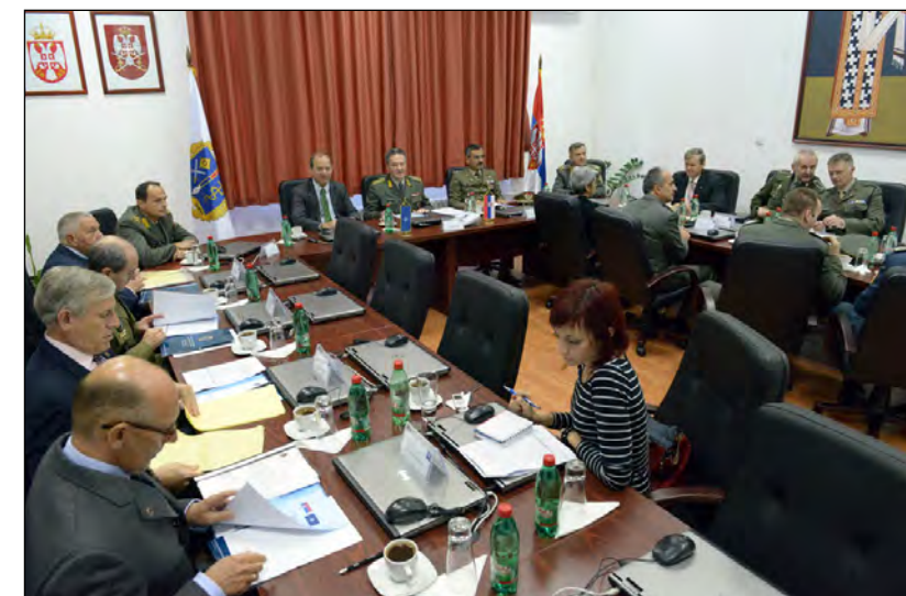
Defence Education and Enhancement Programme (DEEP) Team first visit to Serbia with Austrian, Czech, Romanian, US and NATO experts.