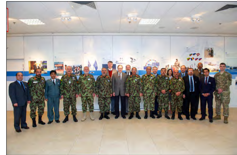
Participants of the Afghan Senior Leaders Seminar (including representatives from ISAF) with the Deputy Secretary General of NATO, Ambassador A. Vershbow, NATO HQ Brussels, 8 November 2013.