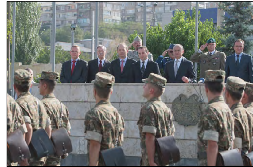
Official inauguration of the first ever senior course in Armenia.

Davenport, Thomas H., and Lawrence Prusak. Working Knowledge: How Organisations Manage What They Know , Boston, MA: Harvard Business School Press, 1998.