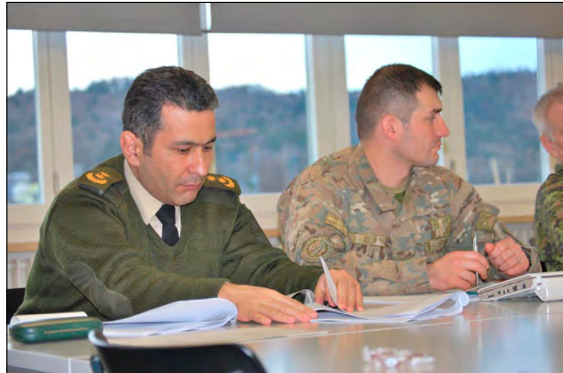
NCO PME RC Writing Teams' Workshop in Lucerne (contributors from Azerbaijan and Georgia).

Not instructed at this level. Material at the Intermediate Level is sufficient.