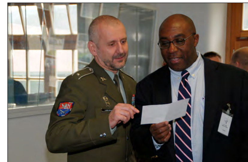
The Canadian Academic Lead discussing ideas with the Czech Peer Reviewer during the NCO PME RC Writing Teams' Workshop in Garmisch-Partenkirchen.