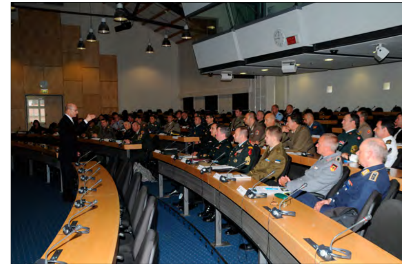
Director of the George C. Marshall European Center for Security Studies addresses participants of the International Senior Enlisted Seminar in Garmisch-Partenkirchen, 2008.

Headquarters, Department of the Army. Field Manual 3-21.8, The Infantry Rifle Platoon and Squad . Washington, D.C.: Training and Doctrine Command, 2007.