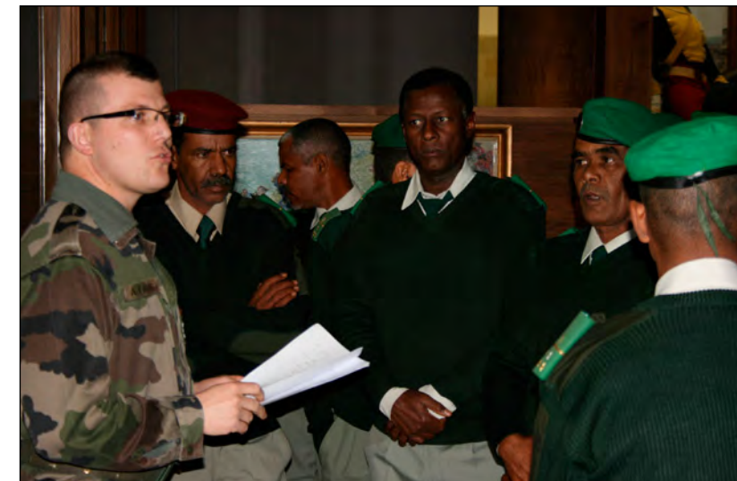
Mauritanian Delegation's visit to the French Staff College in Saumur.