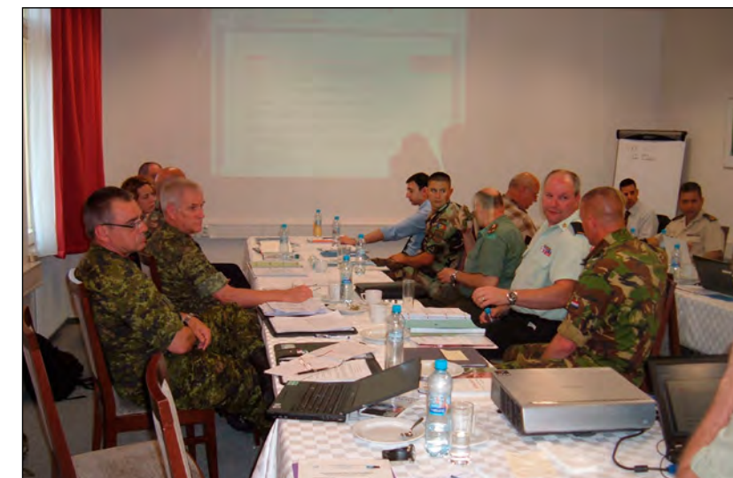
Work in progress during the NCO PME RC final Plenary meeting in Prague.