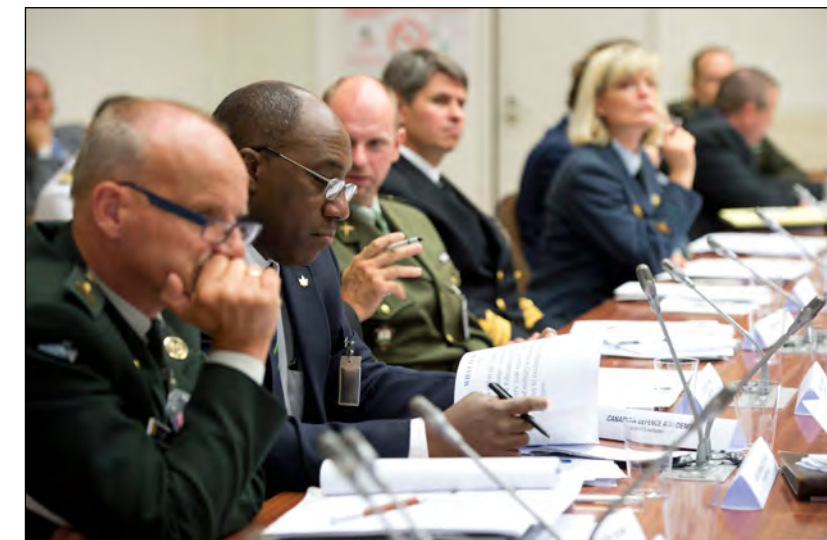
The 1 st functional Clearing-House meeting on Defence Education, NATO HQ Brussels.

"The Young Officer and the NCO – The Regimental Rogue", a series of quotations on the NCO-officer relationship. http://regimentalrogue.com/srsub/officer_and_nco.htm