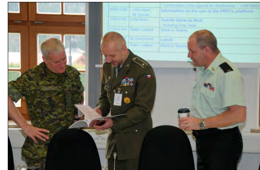
NCO PME RC Writing Teams' Workshop in Garmisch-Partenkirchen (contributors from Canada and the Czech Republic).

Leadership in the Canadian Forces: Leading People . Kingston, ON: Canadian Defence Academy, 2007.