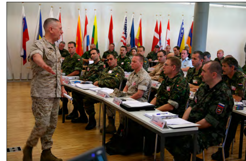
Supreme Allied Commander Transformation addresses students of the International Senior NCO Leadership Course in Lucerne, 2008.