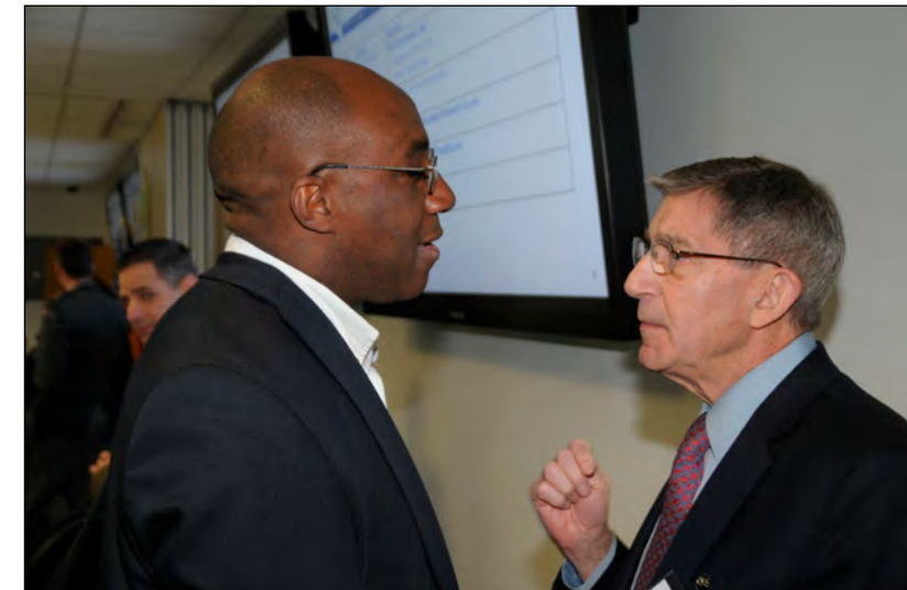
The Canadian Academic Lead with the PfP Consortium representative at the Workshop in Garmisch-Partenkirchen.