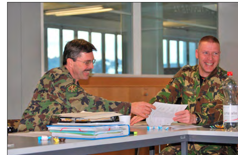
NCO PME RC Writing Teams' Workshop in Lucerne (contributors from the Netherlands and Switzerland).

Applicable national guidance on ethos and values should be provided by national experts.