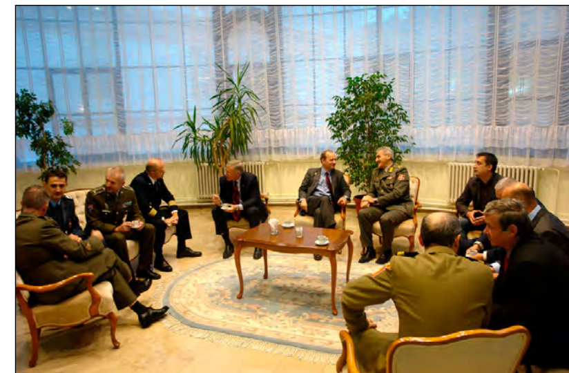
Defence Education and Enhancement Programme (DEEP) Team first visit to Serbia – lively discussions between NCOs, officers and civilians lead to many agreements.