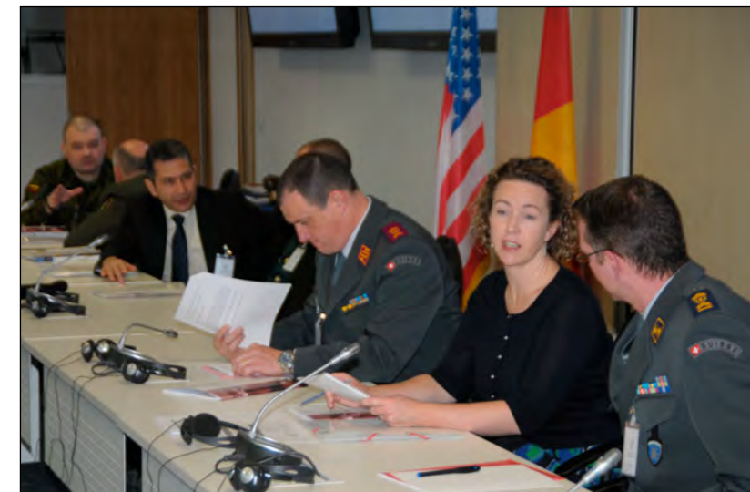
Centre for the Democratic Control of Armed Forces (DCAF) representative streamlining UN Security Council Resolution 1325 on Women, Peace and Security into the Curriculum.