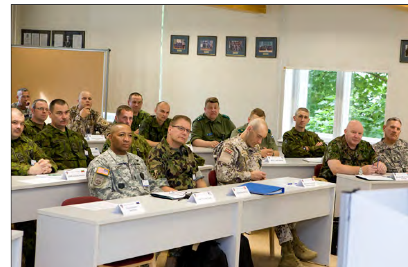
Baltic States Senior NCO Seminar.