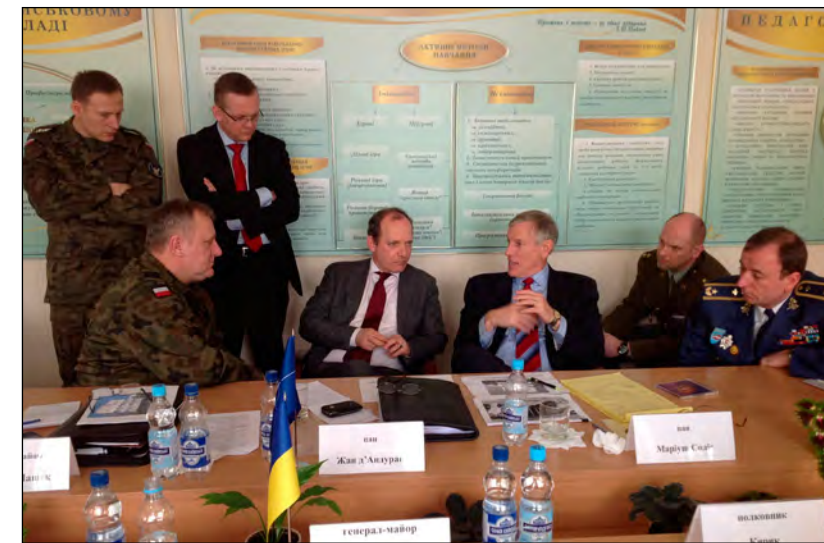
Defence Education and Enhancement Programme (DEEP) Team first visit to Ukraine with Czech, Polish, Slovak, US and NATO experts.