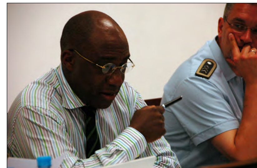
The Canadian Academic Lead summarizing his views at the Prague Plenary meeting.