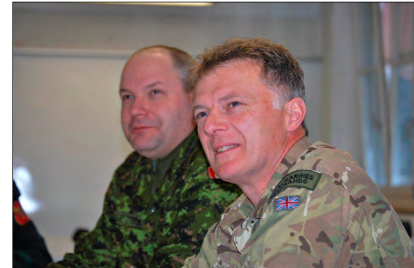
NCO PME RC Writing Teams' Workshop in Lucerne (contributors from ACT and Canada).

U.S. Army, Training Circular 3.21-20, Army Physical Readiness Training . Washington DC: March 2010.