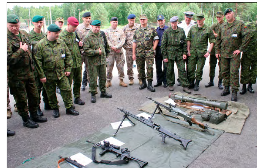
Participants of the Baltic States Senior NCO Seminar visiting an Estonian Army unit.