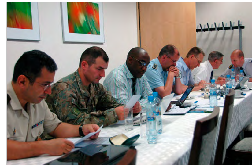
NCO PME RC final Plenary meeting in Prague including contributors from Azerbaijan, Canada, Georgia, NATO, PfPC and Switzerland.