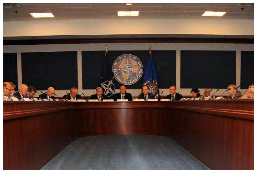
The 2 nd functional Clearing-House meeting on Defence Education, Allied Command Transformation (ACT), Norfolk.