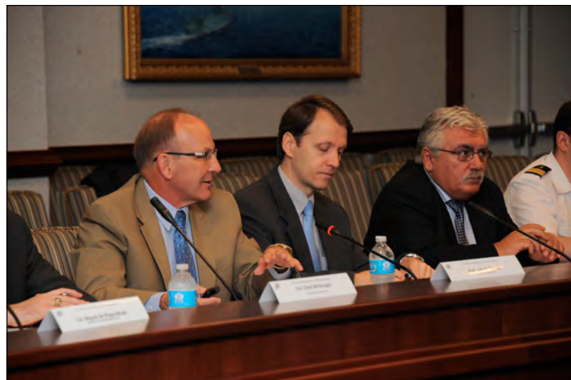
The 2 nd functional Clearing-House meeting on Defence Education, Allied Command Transformation (ACT), Norfolk.

Subject matter experts (SMEs) will work with host country to select appropriate readings.