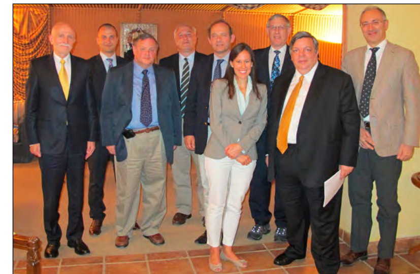
Defence Education and Enhancement Programme (DEEP) Team first visit to Iraq, meeting with the NATO Transition Cell.