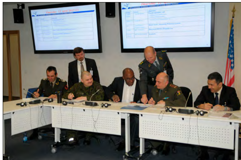
NCO PME RC Writing Teams' Workshop in Garmisch-Partenkirchen (contributors from Armenia, Azerbaijan, Canada, Lithuania, Republic of Moldova, PFP Consortium and Switzerland).