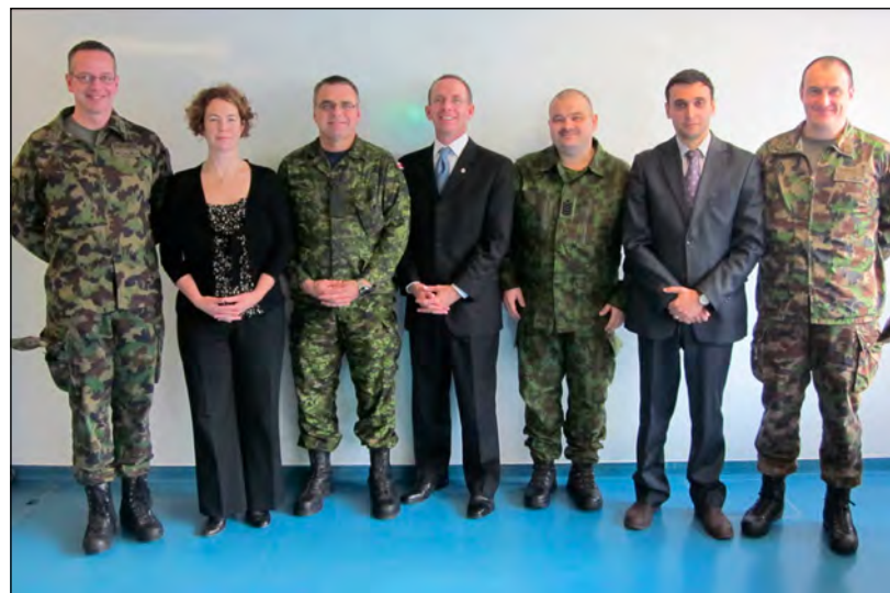
The Profession of Arms Writing Team during the workshop in Lucerne.

Values and Standards of the British Army, January 2008. http://www.army.mod.uk/documents/general/v_s_of_the_british_army.pdf