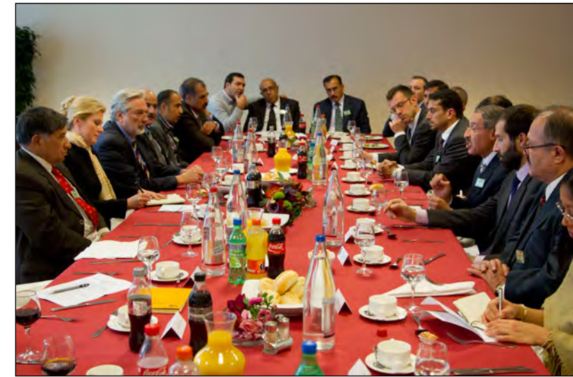
Afghan Senior Leaders Seminar - Working lunch with NGOs, 2012.