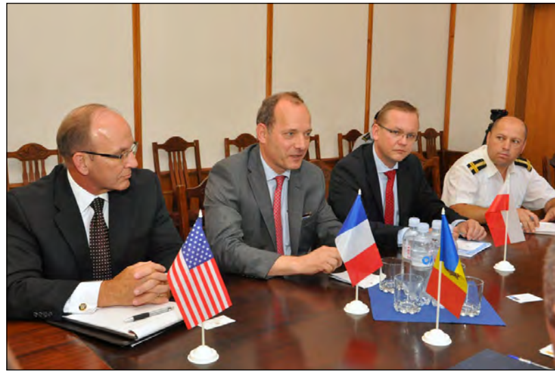
Defence Education and Enhancement Programme (DEEP) Review with the Moldovan Ministry of Defence.