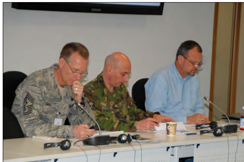
NCO PME RC Writing Teams' Workshop in Garmisch-Partenkirchen (contributors from ACO, the Netherlands and the USA).