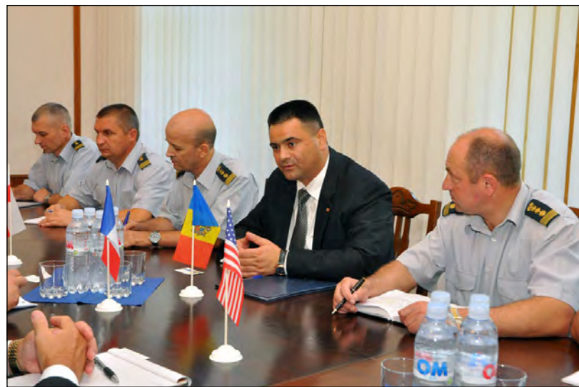
The Moldovan Minister of Defence discussing the DEEP Review with the Expert Team in Chisinau.