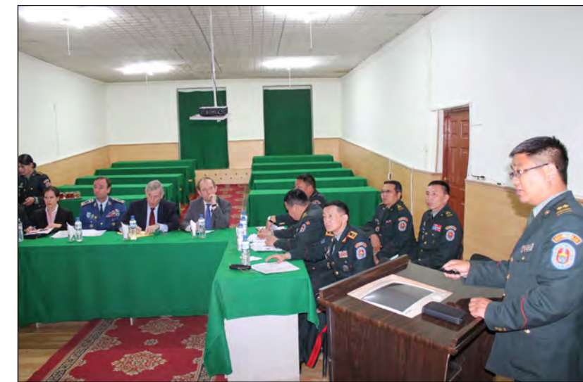
Defence Education and Enhancement Programme (DEEP) Team first visit to Mongolia.