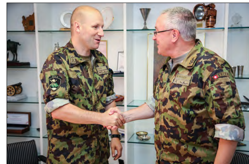
The Commandant of the Swiss Armed Forces College thanking the Project Manager for the excellent work.