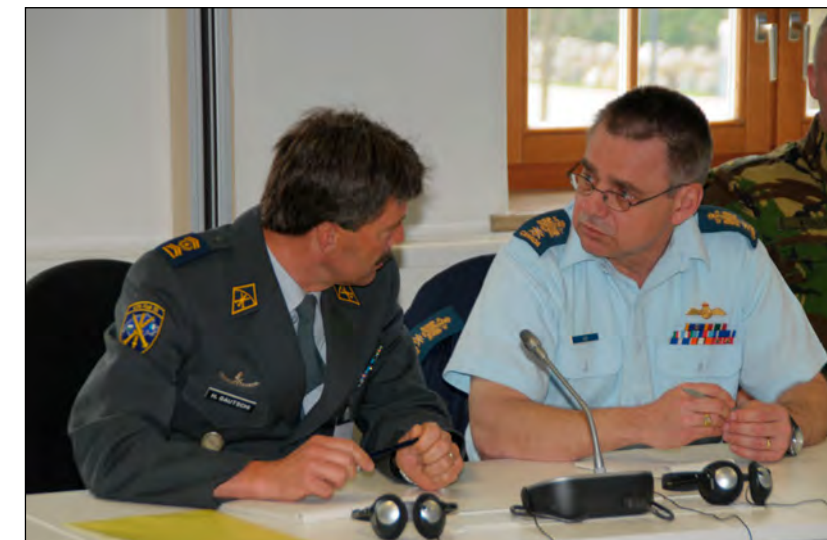
NCO PME RC Writing Team Leads (Switzerland and Canada) consulting during the workshop in Garmisch-Partenkirchen.

Applicable national readings on ethos and values will be selected by recognised subject matter experts.