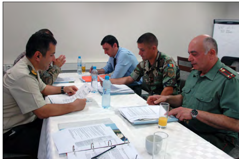
NCO PME RC final Plenary meeting in Prague including contributors from Armenia, Azerbaijan, Republic of Moldova.